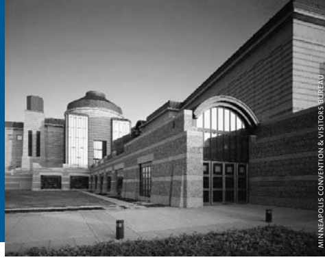
MINNESOTA HISTORICAL SOCIETY

MINNEAPOLIS CONVENTION & VISITORS BUREAU