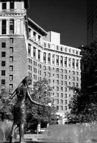
SAINT PAUL HOTEL