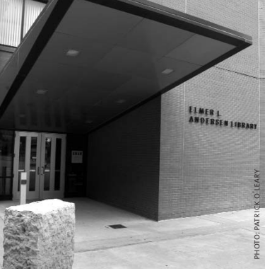
ELMER L. ANDERSEN LIBRARY