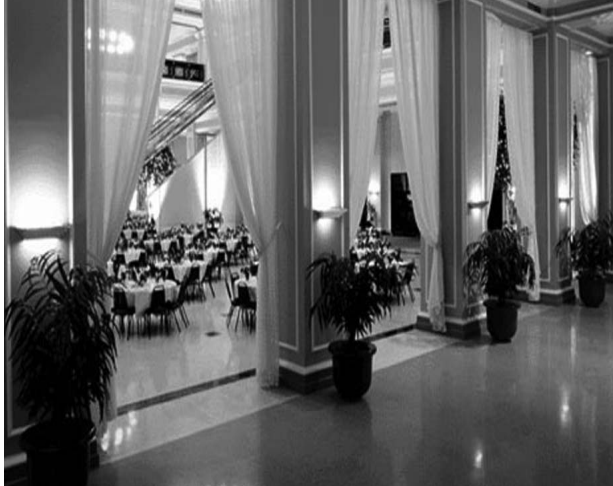
THE GREAT HALL BANQUET & CONFERENCE CENTER